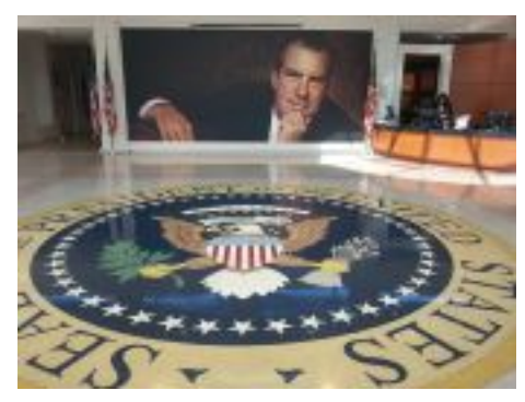
The impressive entrance at the museum.