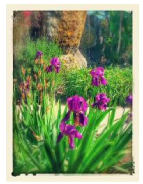
Irises ~ Poolside at Arcadia Gardens Remember we have tables out by the pool to enjoy a visit with a friend or family member. Take Advantage!