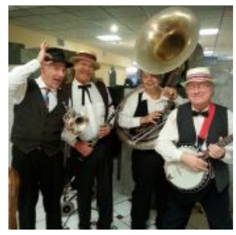
Great performance by the "Crown City Dixieland Band."