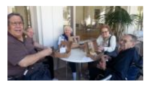
Delicious boxed lunches...thanks to our kitchen!