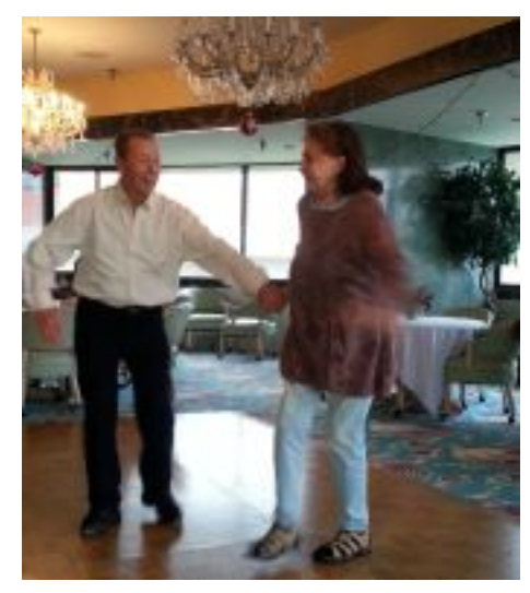
A great time at "The End of The Month Dance" in the Penthouse!