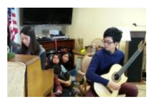
Students from Temple City & San Gabriel High School perform.