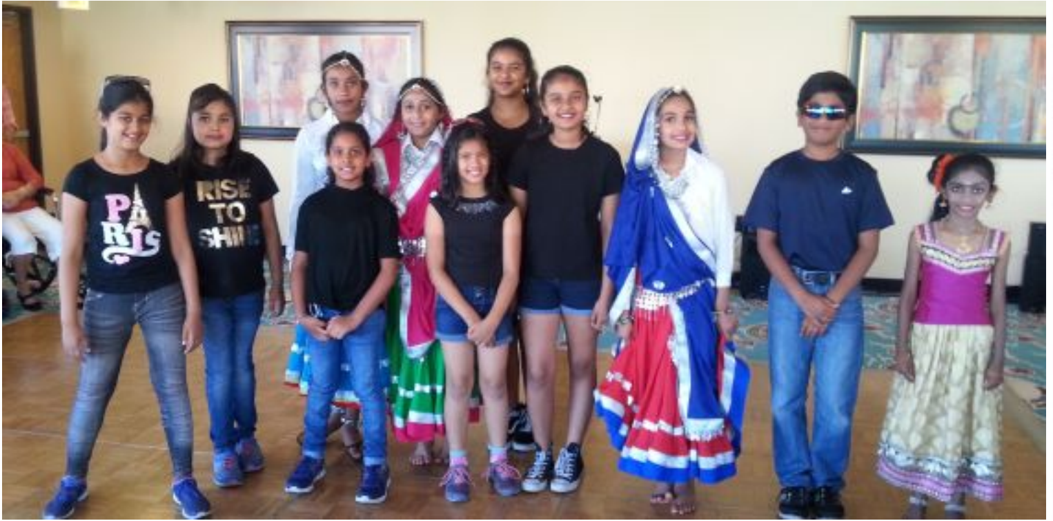
"Colors of India" student performers in the Penthouse.