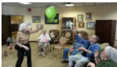
Stayin' fit with "Balloon Volleyball"