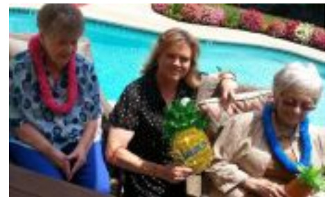
Ready for Summer!