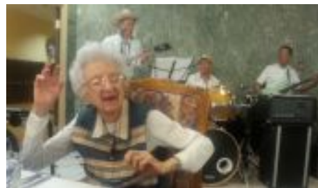
Dorothy feeling the music on Father's Day!