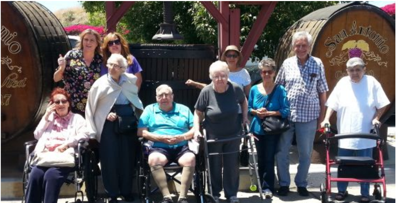
A great lunch outing at the San Antonio Winery!