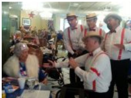
Fourth of July serenade.