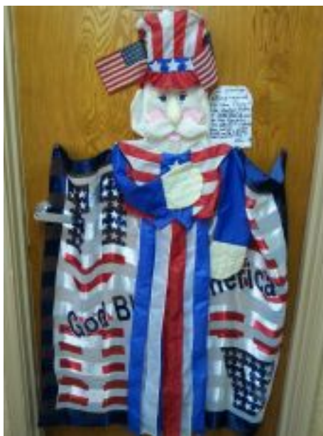
4th of July Door Decor Contest