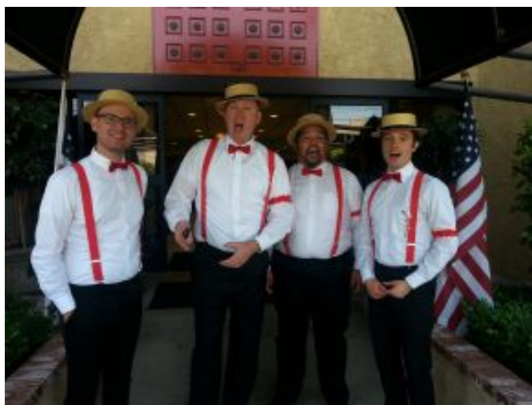
"The Accidentals" Barbershop Quartet