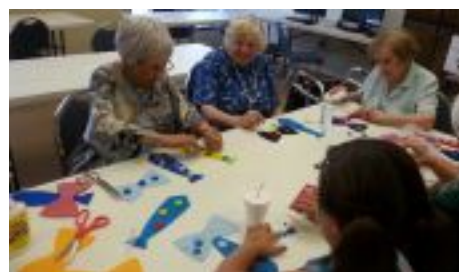
Craft time and some ties for some Father's Day decor.