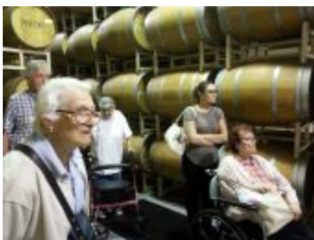
Trip to the San Antonio Winery ... Great tour!