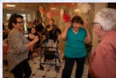
Rockin' & Rollin'