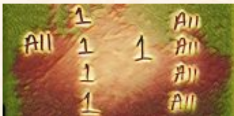
The 3 Musketeers' Motto