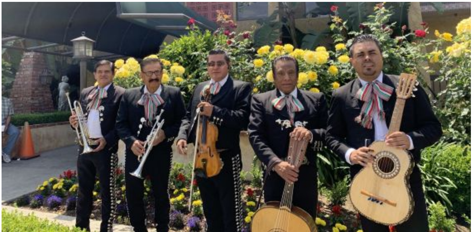
Mariachi Los Gallitos did a great job on Cinco de Mayo.