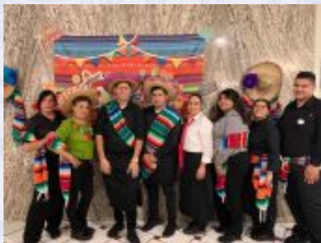
Our Servers having some fun on Cinco de Mayo!