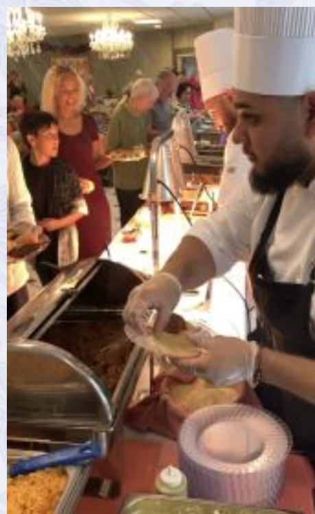
A delicious array of food at the buffet