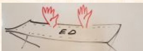
Busted in the act