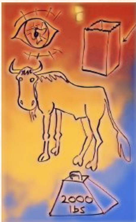
He invented calculus and discovered the laws of motion. (The animal is a Gnu.)