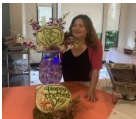
Beautiful carvings by Hiara