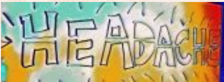
A Pain in the Brain