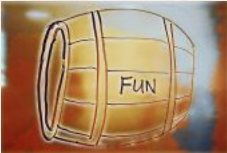
Gallons of Merriment