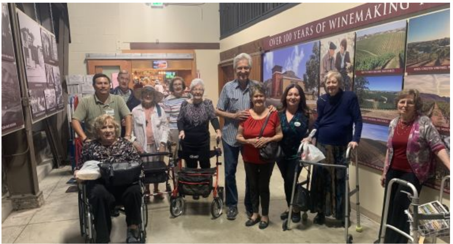
Trip to the San Antonio Winery - Downtown, L.A.