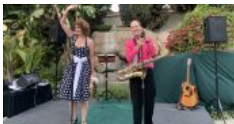
Two for The Show...a Favorite.