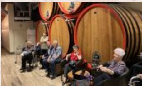
A very informative tour at San Antonio Winery!