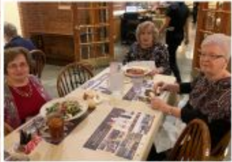
Can you say Buon Appetito?