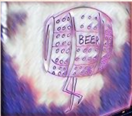
A Lively European Dance Song