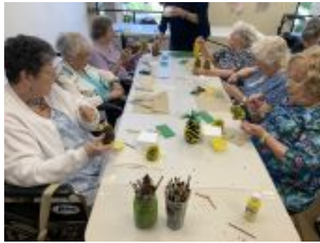
We always have a fun time crafting & visiting!