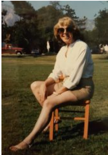
Name Her and Win $300 Playdough Bucks from Activities