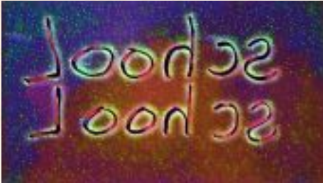
After Summer Vacation We Go