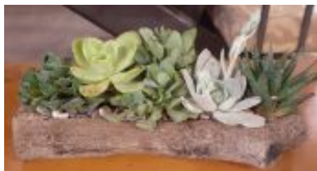
Another birthday delivery for someone special.