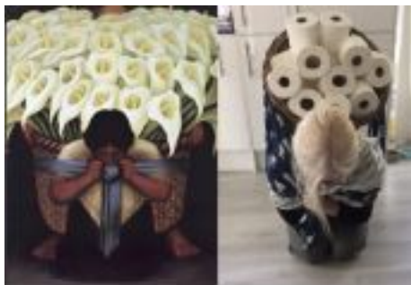
Diego Rivera stocks up?