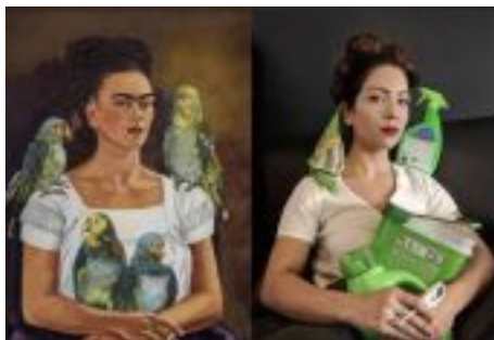
Kahlo cleans up?