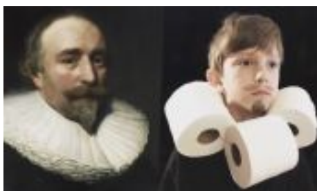
Latest version of the tidy collar?