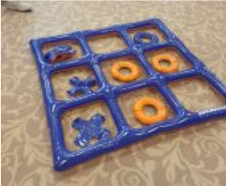
We are also getting pretty good at Tic, Tac, Toe!