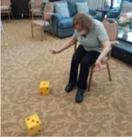
7, 11, or doubles....That's what Nvair is shootin' for!