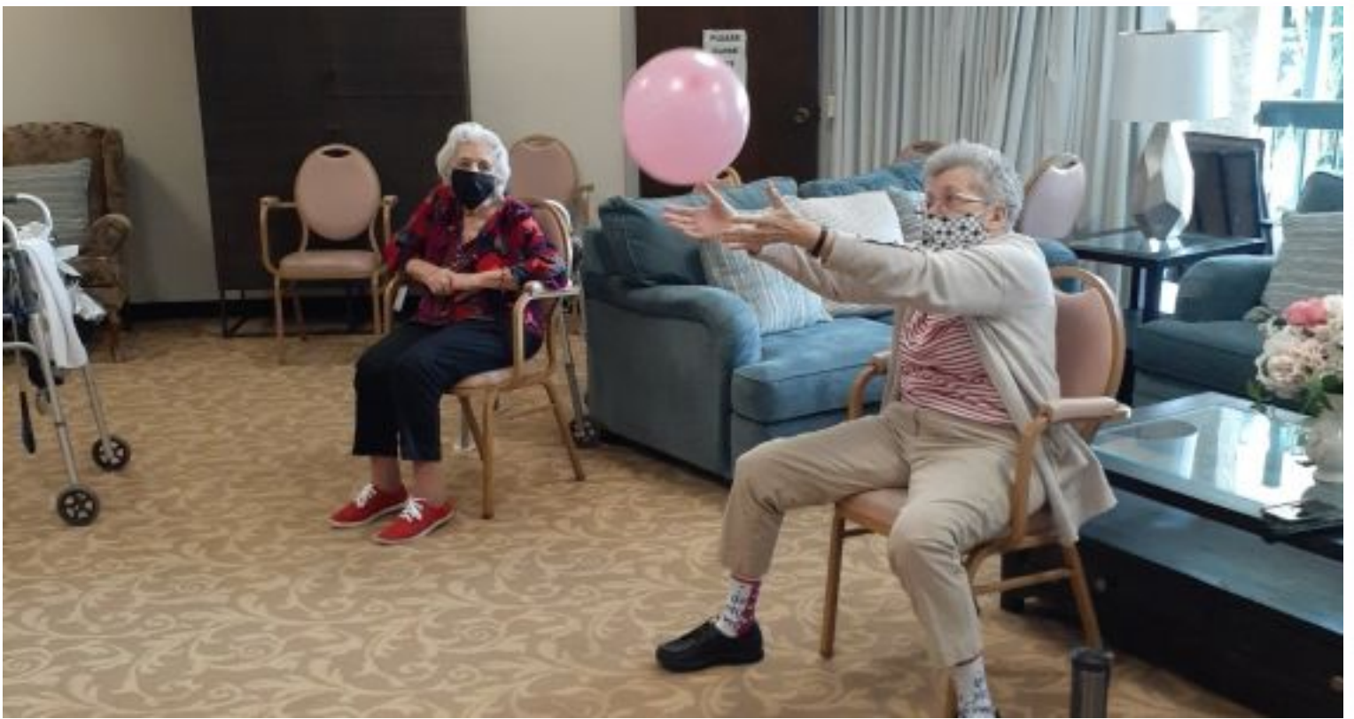
Staying active is important (socially distant). It's good for the body and soul!