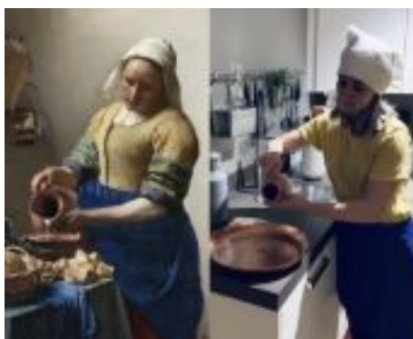
Some things never change ...