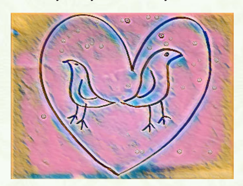
Old-fashioned name for an adoring couple.