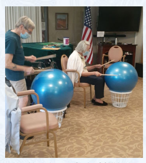
Music is great for the SOUL!