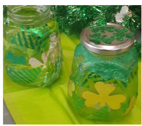
St. Patrick's Day Crafts. Watch for dates for Earth Day Crafts this month. Earth Day is April 22nd.