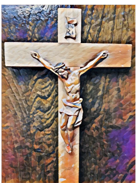
~ Crucifix ~