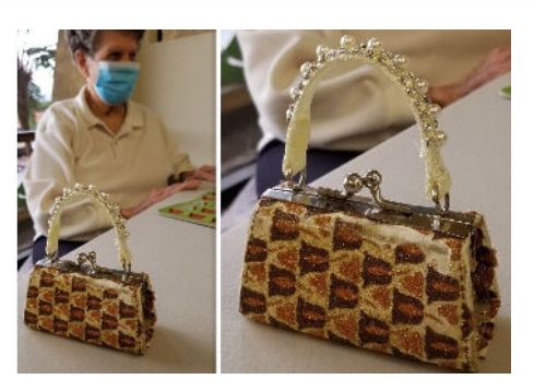
Rix Fix It - New Purse Handle for Doris