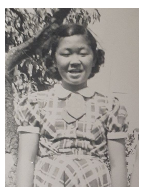
This resident still looks the same in my opinion... just a few years older. Can you guess who this is? Answer bottom right pg. 7.