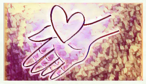
When you offer your affections.