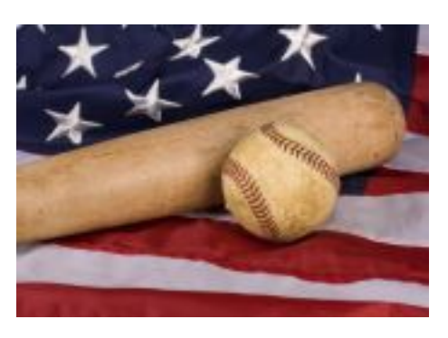
Opening Day, Thurs. April 1st!

For baseball fans, the most important event of the year takes place this month: opening day! Come root for the home team at our opening day party, then make plans to join us the rest of the season as we watch MLB games together. Check the calendar for details!