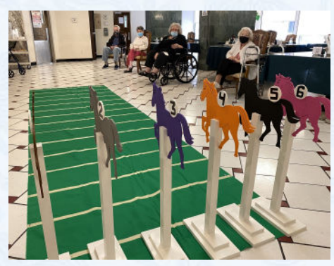
Watch for next month's races...time to be announced.