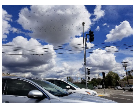
Ice Cream Castles in the Air ...