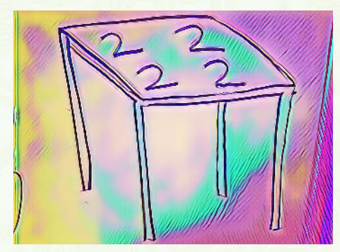
A cozy, romantic seating for a couple. (How many "2's" are there?)