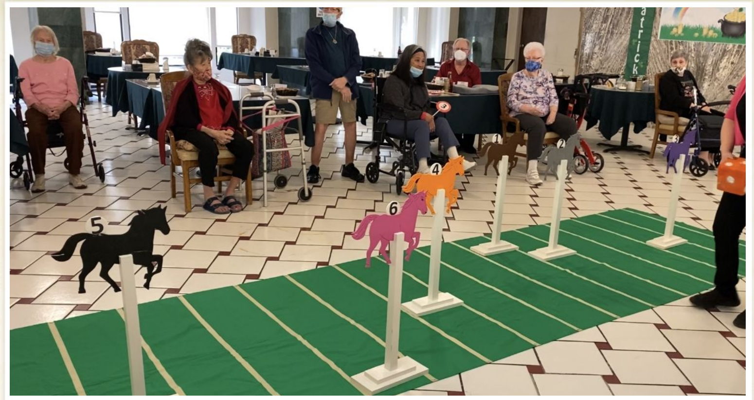
Arcadia Horse Racing Derby...We had ourselves a BLAST!