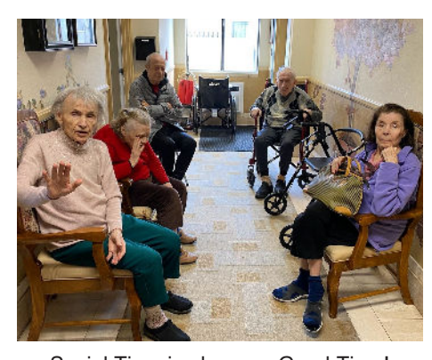
Social Time is always a Good Time!

With the warmer weather coming we plan to be out on the patio soaking up some of that rich Vitamin D. We have been busy in Memory Lane. Whether we are crafting, exercising, or making music, we keep busy and are looking forward to a bright and energized SPRING!