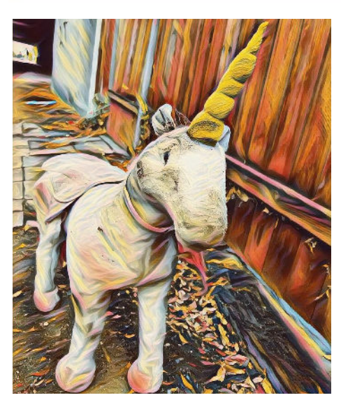
Found on the Roadside ...