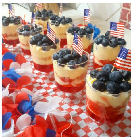
Fantastic food for the Fourth of course!