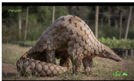
Scaly Anteater of Sub-Saharan Africa