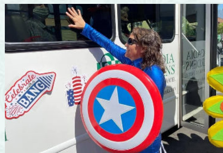
Even Captain America said "HELLO"!