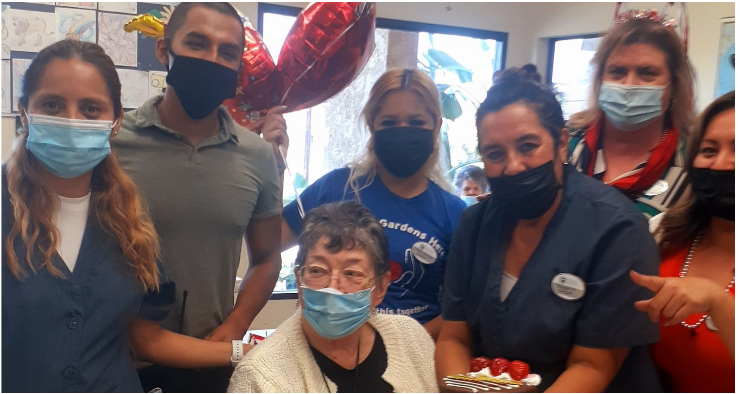
Celebrating good times with our residents!