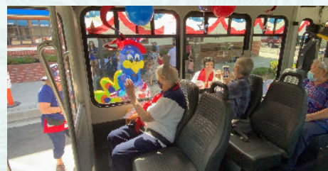
A reverse parade where the people on the streets, wave at us (the cars, etc).