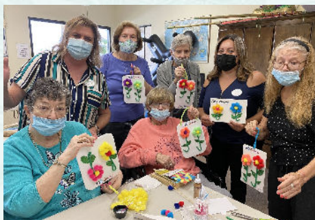
A great way to spend creative time with friends.