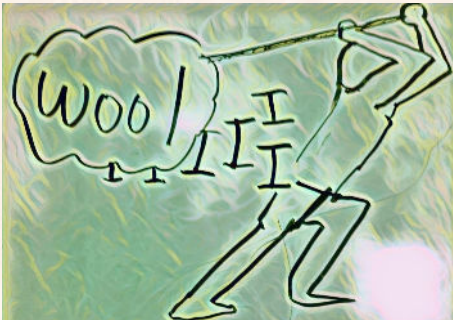
Said When Someone's Trying to Fool You