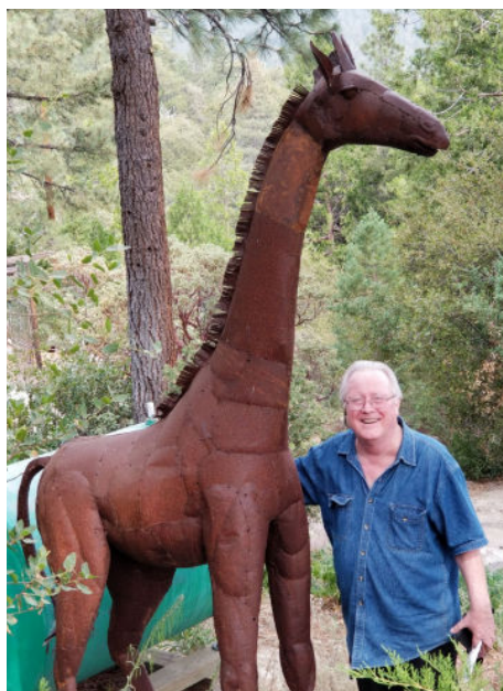
Registering with the "Giraffe" Board?