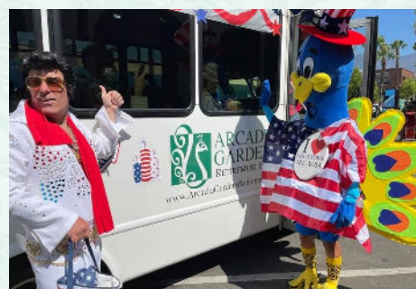
Look who stopped by...Elvis & The Arcadia Peacock!