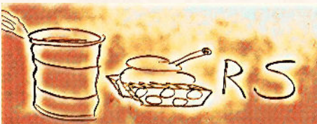
A Word Meaning "Cranky" and Ill-Tempered (Soup is Often Contained in The First Object)