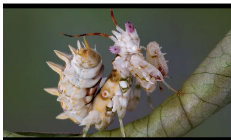
Orchid Mantis of Malaysia