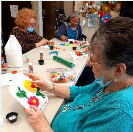
A Little Summer Crafting