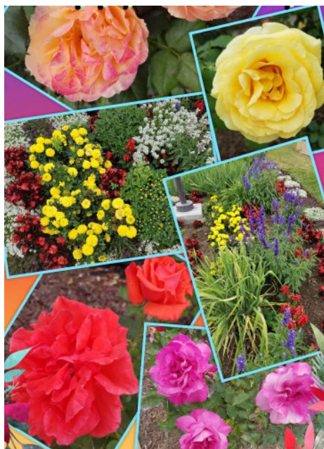
All In Our Front Yard!