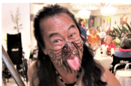
This is especially for Sheila's Exercise PALS!!!