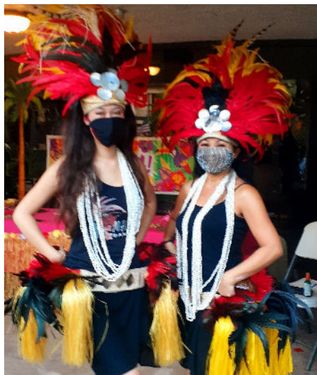
Beautiful Manea Polynesian Dancers