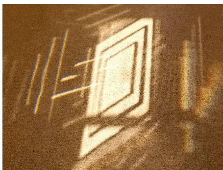
$300 Play Dough to who identifies this!