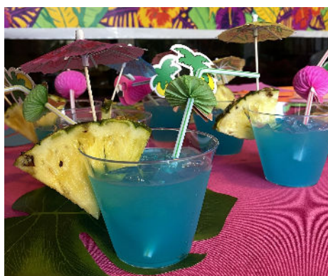
Aloha to summer ....hello Fall