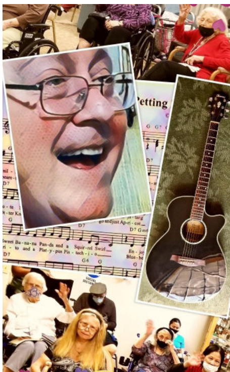
Sing Along Sat 10:30 a.m.