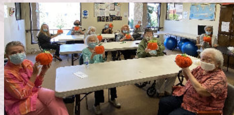
Oh yes they do...Let the pumpkin season continue!