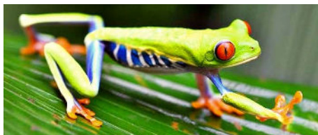
Red-Eyed Tree Frog - Central America