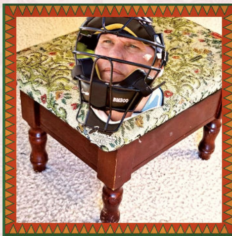
Turkoman Territory 14th - 20th Century Footstool Meets Baseball Ref(?)