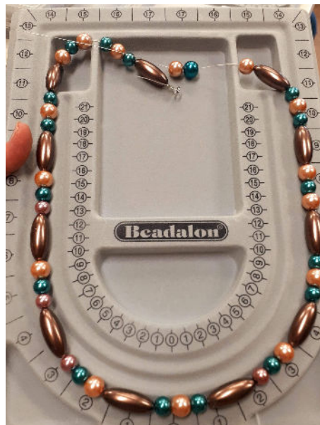
Crafting is a great way to spend time with friends. Kay's necklace in progress.