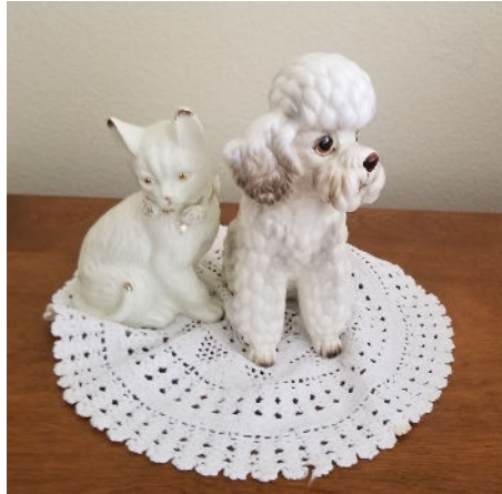
Kitty, Poodle and Doily