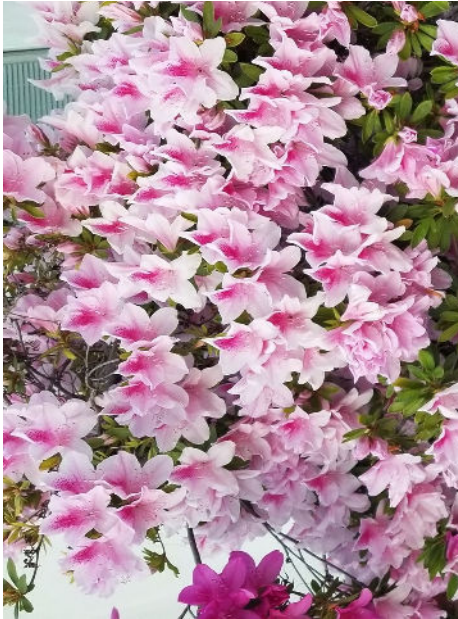
Azaleas in Bloom