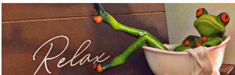
Aggie the Tree Frog Kickin' it