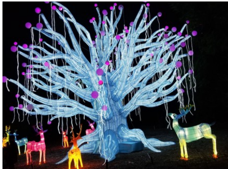
More Moonlight Forest Wonders