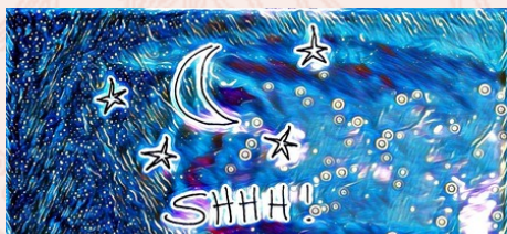
Christmas song about a special quiet evening when Christ was born.