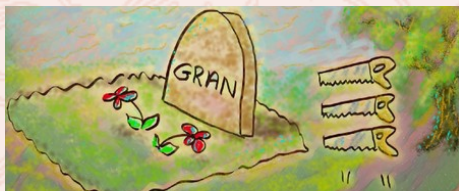
A tart, red holiday sauce.