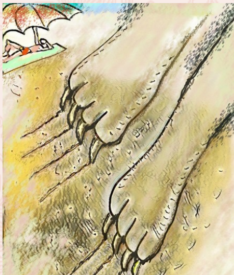
What a cat gets on the beach at Christmas. (Who says, "Ho Ho Ho?")