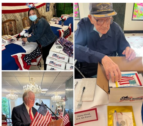
Operation Gratitude boxes from the city of Arcadia were delivered for our Vets!