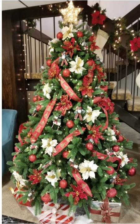
Hiaira's Splendid Tree Decor!