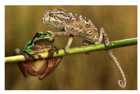
That's quite enough out of YOU!