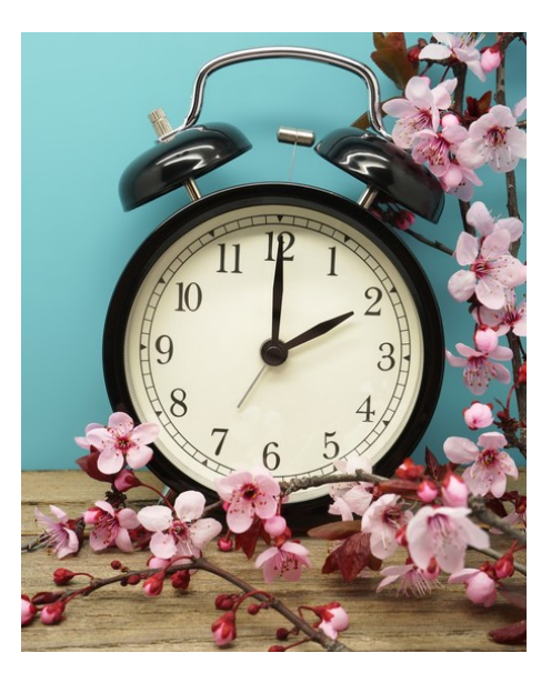
Daylight Saving Begins Sunday, March 12th Set clocks ahead one hour on Saturday night, Mar. 11th.