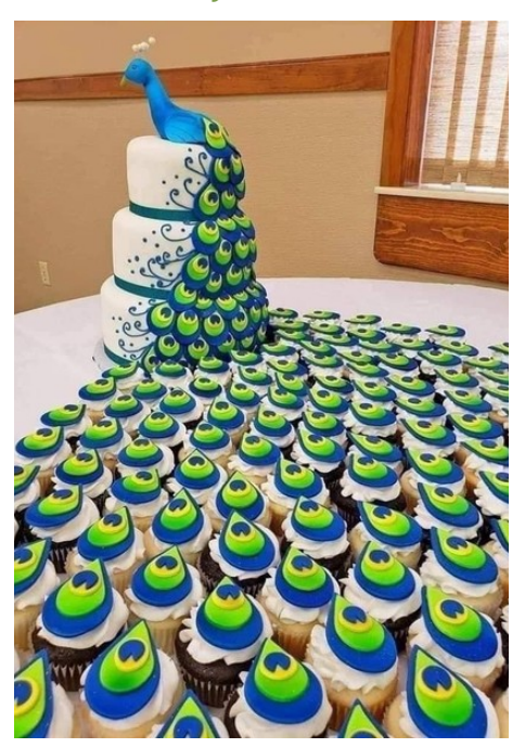
AG Home Symbol