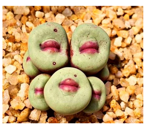
South African "Kissy" Succulents