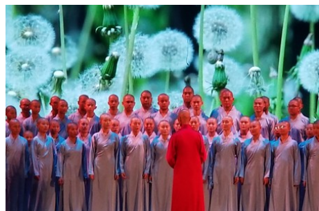
Jinhui Chorale at San Gabriel Playhouse