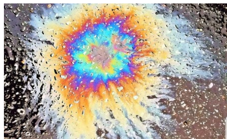
Oil rainbow on a wet road