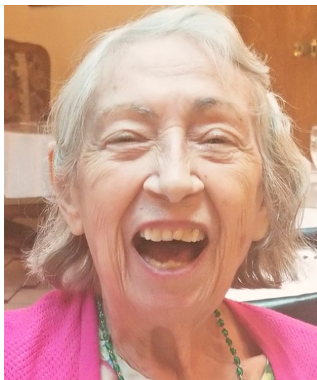
Celeste's pure joy!